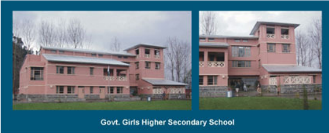
Govt. Girls Higher Secondary School

The profession has become a knowledge based profession rather than a craft based one. We, in Pakistan, are still struggling with the notions of appropriate technology and other such concepts. It doesn't mean that we lack ability or the mental capacities in any way, but we have not yet made certain basic decisions about our direction as a nation.