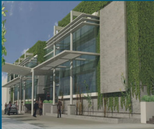
Proposed Head Office Building for AkzoNobel

We are currently working on a variety of projects. The diversity is of typology, size and geography. We are working on corporate head-office buildings in Lahore and Karachi. As well as some schools and health centers in Northern areas. There are some Pharmaceutical facilities in Karachi. We are also involved in some offices and banks' interiors and some residential projects. All in all we are trying to stay busy and help improve the built environment.