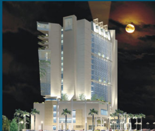
Winning Entry of the Competition Project for National Investment Parks

7) What message would you like to convey to upcoming generation of architects?