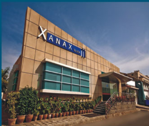
Pfizer Medical Building

This makes me feel really old; it's like receiving a Life Time Achievement award. Anyway, my message to the fellow upcoming architects is to strive for quality. Stylistic debates are for the art critics and historians. We as architects should concentrate on creating wonderful buildings and spaces that bring joy to the human spirit.