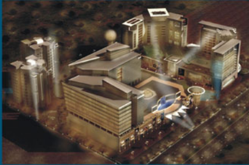
Development for Bahria.