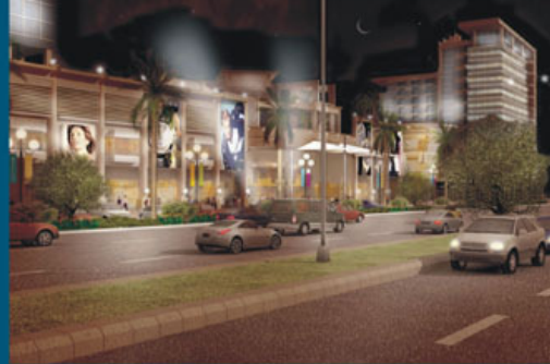
Development for Bahria.

Gehry still have to conform to all the fire and safety codes and accessibility requirements. So it makes you appreciate their work even more as coming up with such exciting designs while fulfilling all the technical and safety requirements is no easy task.