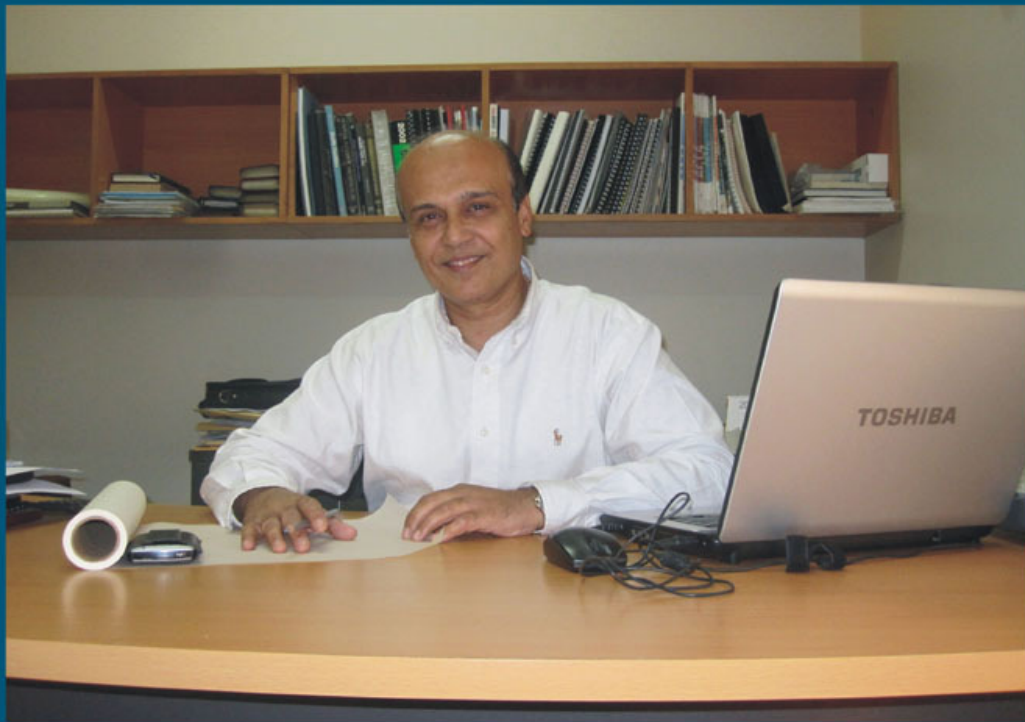
Architect of the Month

“Architecture has become knowledge based rather than craft based”.